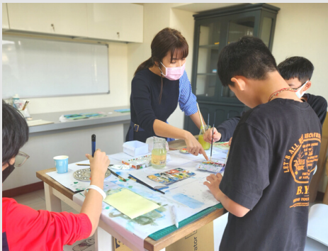
Term 2, Watercolor

The photos on this page are some moments from our self-expression, as an example.