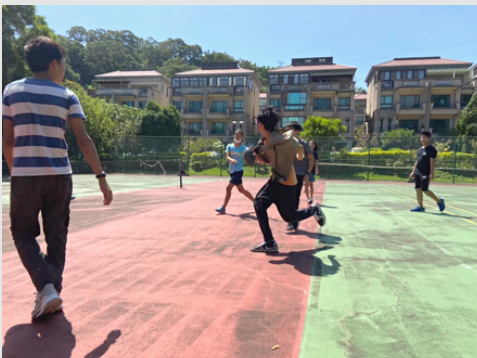
The whole year, PE