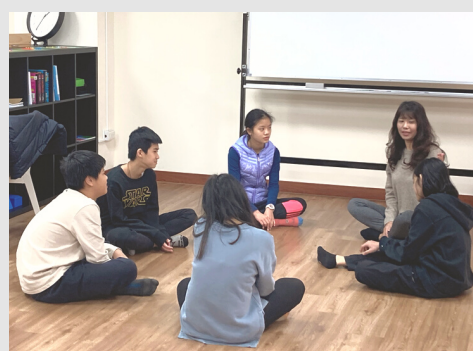
Term 3, Drama and Movement