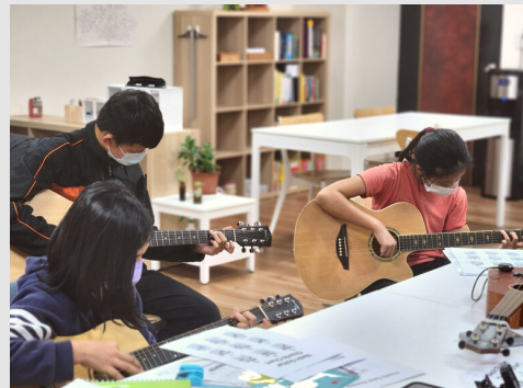
Term 2, Music (Guitar)