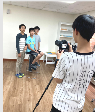
Term 4, Photography