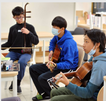
Term 3, Music and Composition